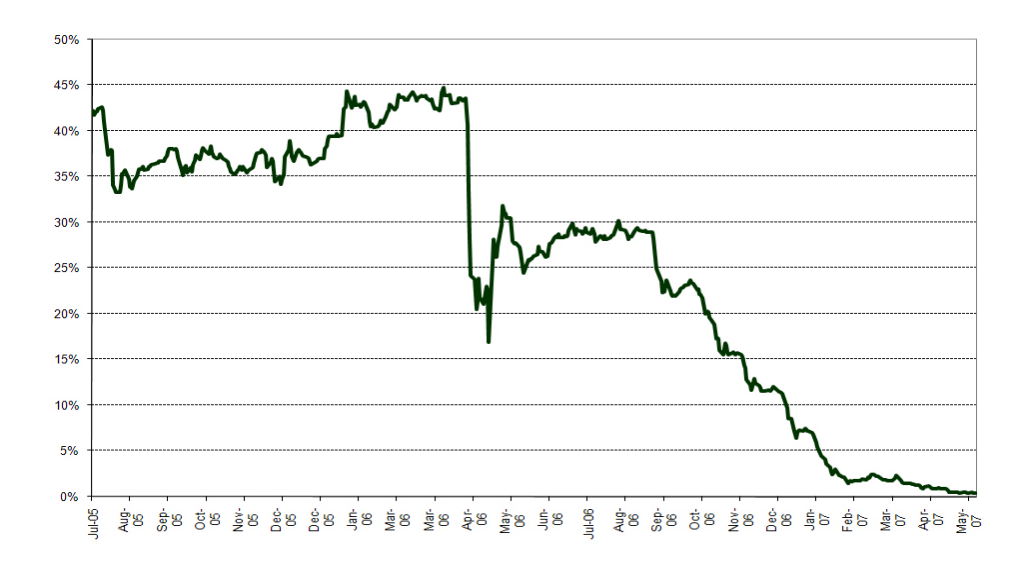
Figure 2: Probability of EUA shortage à la Ellerman & Parsons (2006)