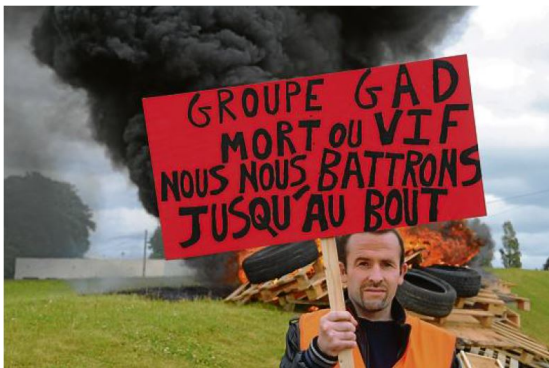
Figure: "GAD group: dead or alive, we'll fight till the end"